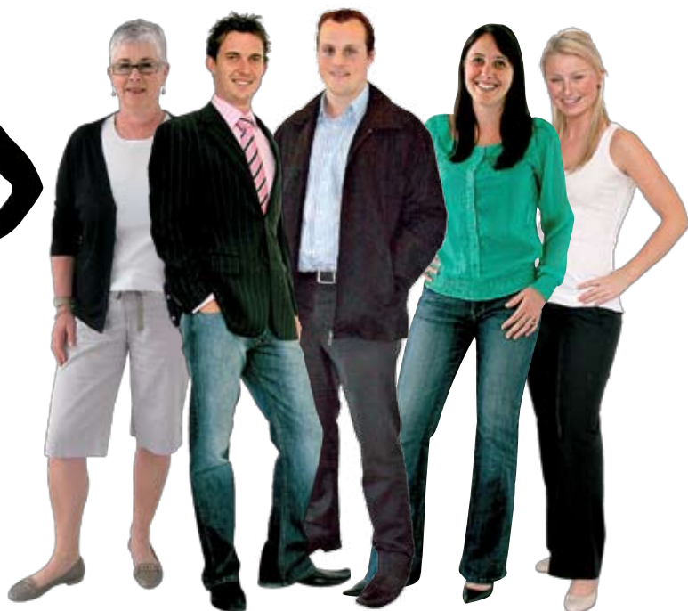
Non-tailored casual pants Jeans Zippered jacket, no tie Jeans Tank top